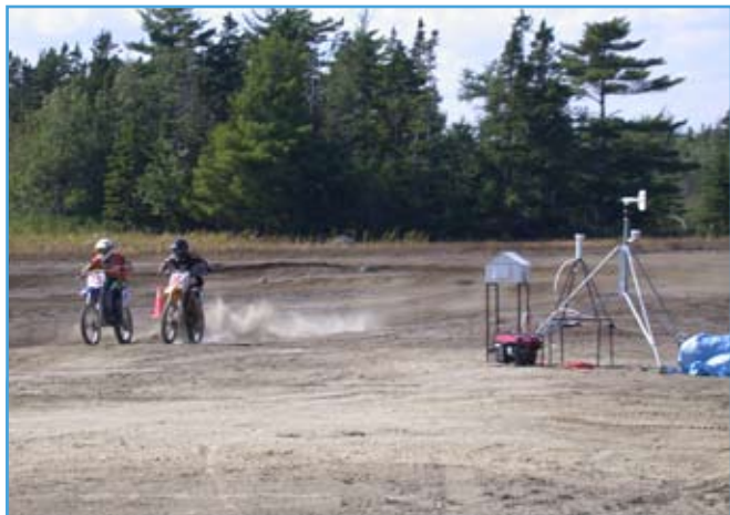
Figure 1. Children driving dirt bikes on historic gold mine tailings at Montague Gold Mines near Halifax. The device for collecting airborne particles is shown at the right.

Historic gold mine tailings in Nova Scotia, Canada contain significant amounts of arsenic, a result of mining and processing naturally arsenic-rich ore during a time of unregulated industrial activity (1860 to the mid-1940s). Many of these sandy tailings areas are now located close to residential areas, are publicly accessible, and are used for recreational purposes such as dirt biking, all-terrain vehicle (ATV) use and trail walking ( Figure 1 ). Accidental oral ingestion or inhalation of arsenic-bearing particles may present a health risk for humans.