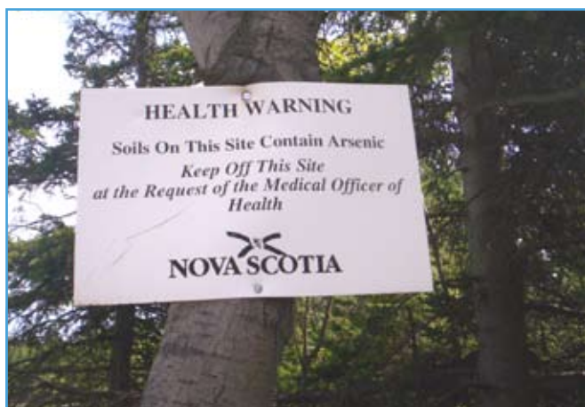
Figure 3. Halifax, Nova Scotia. Warning sign posted at a tailings site .